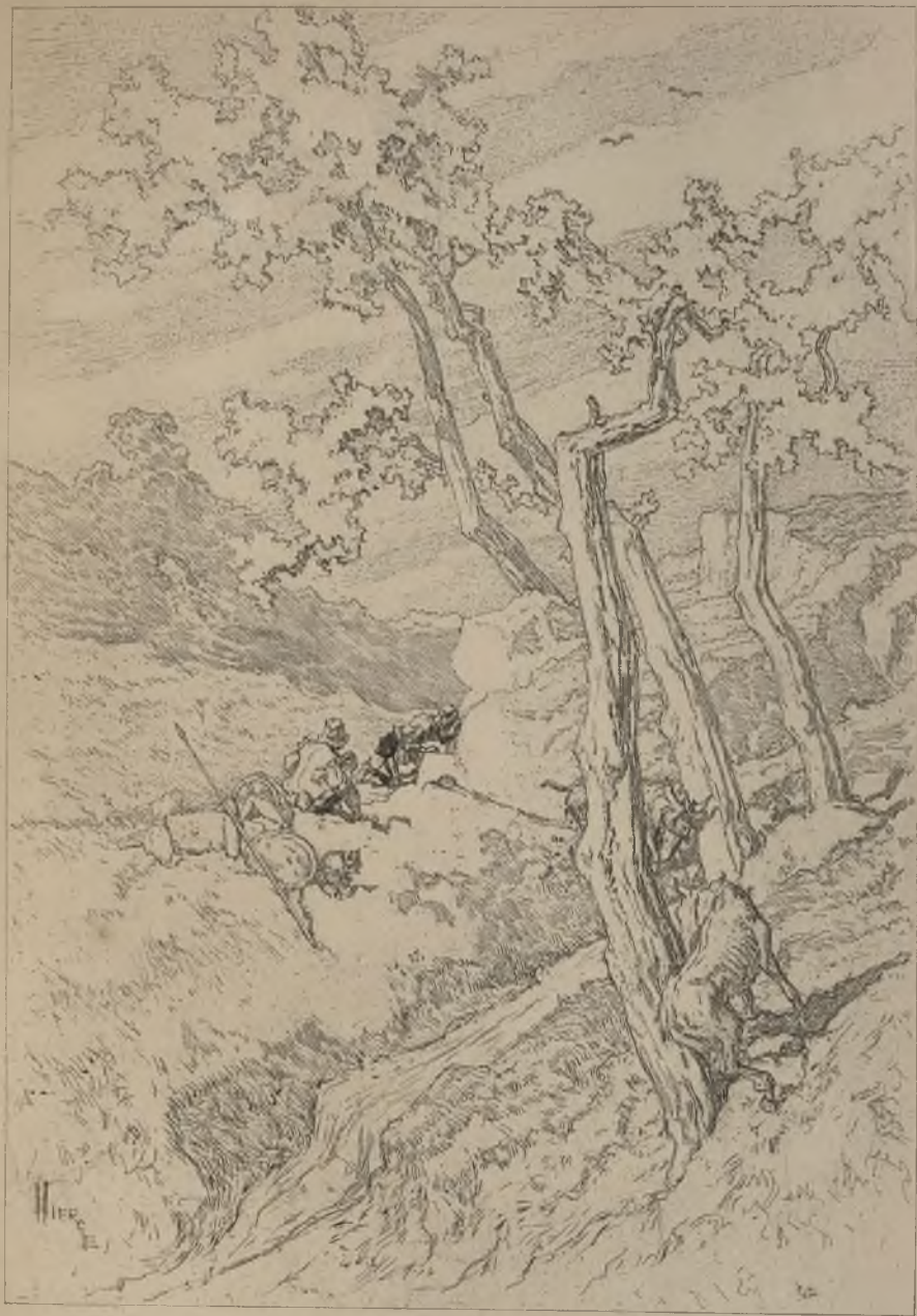
At the Fountain.