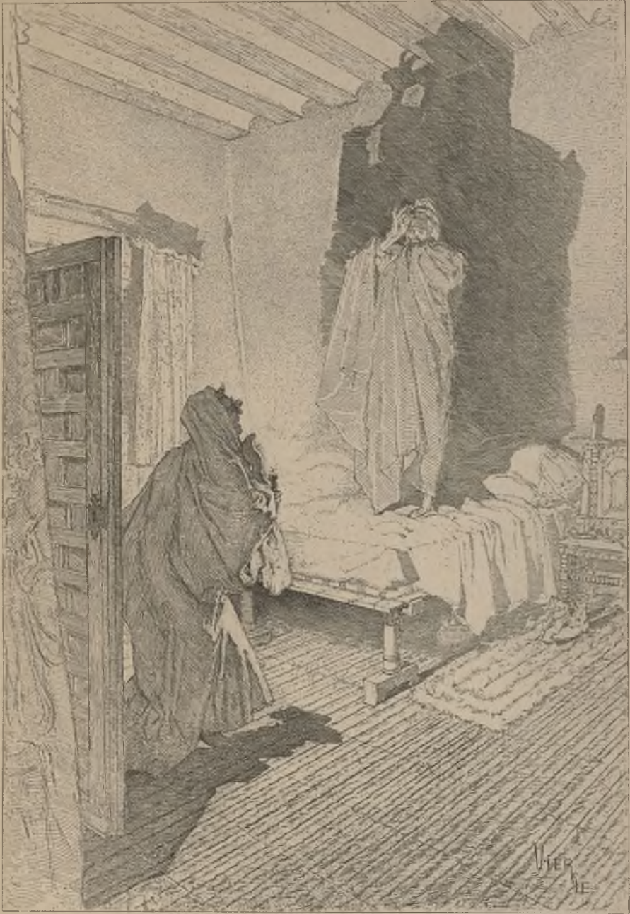
Don Quixote Surprised by Donna Rodriguez.