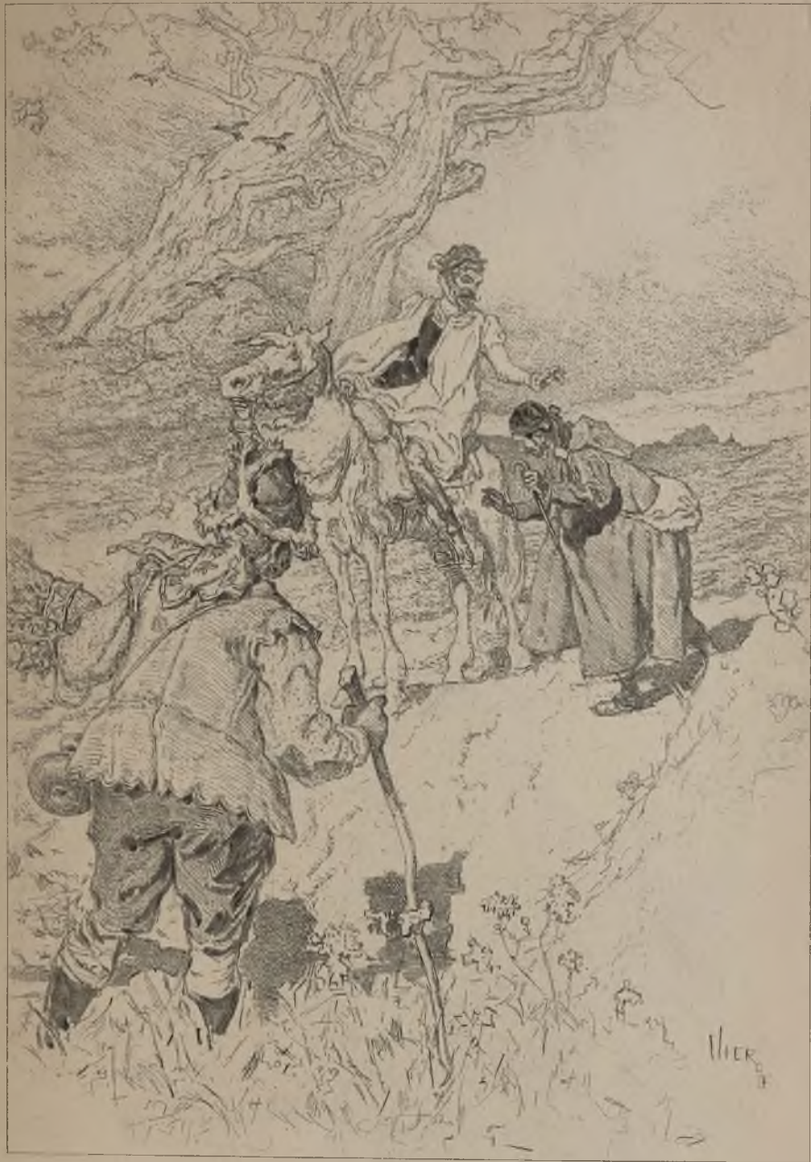
Fasikos Groots Don Quixote.