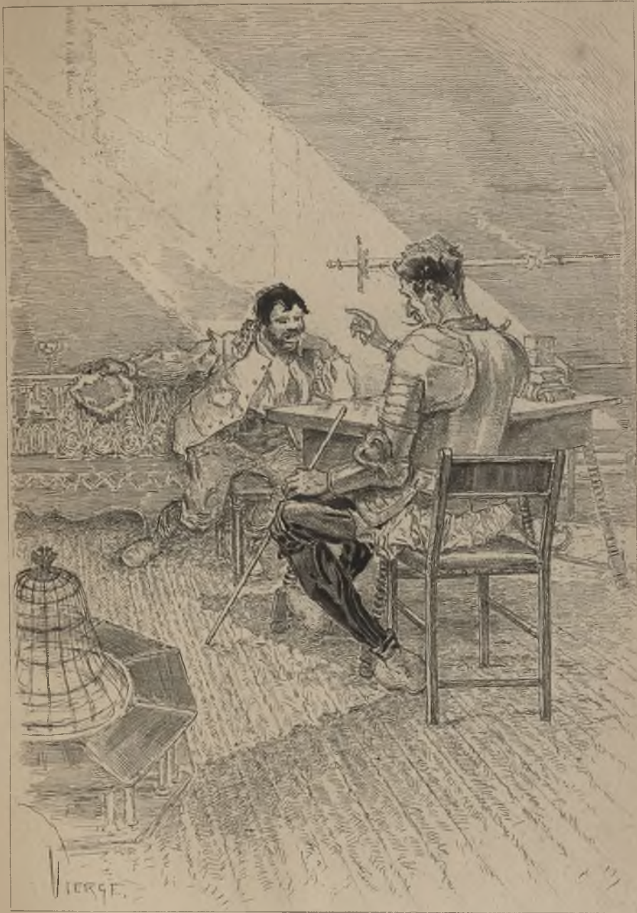
Sancho Exhorted to Govern Well.