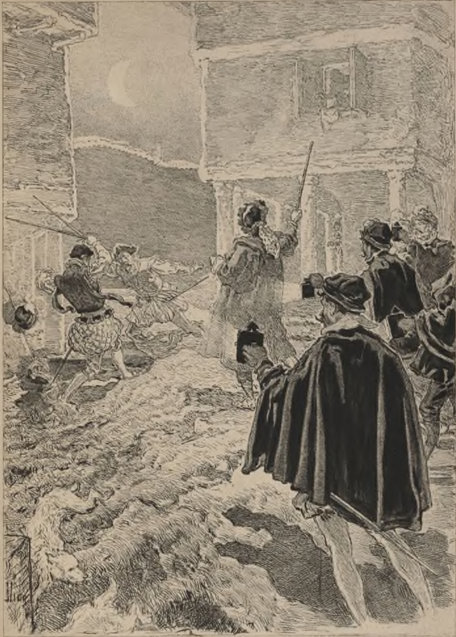
Sancho Comes Upon the Brawlers.