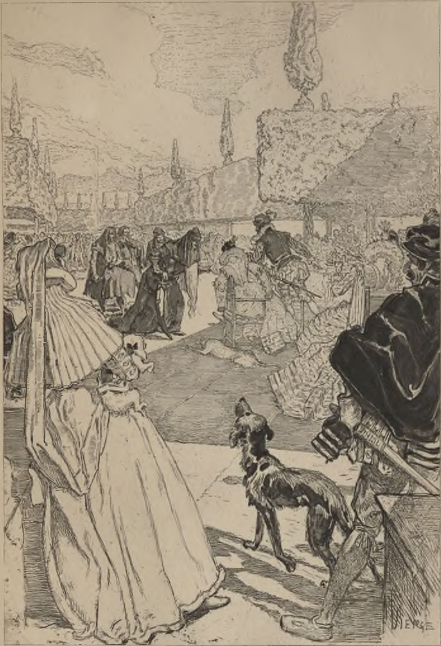
Squire Trifaldin in the Duke's Garden.