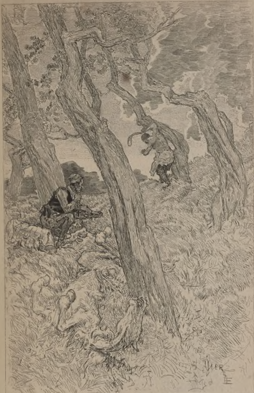
Sancho Rib-bastos and Lashes Himself