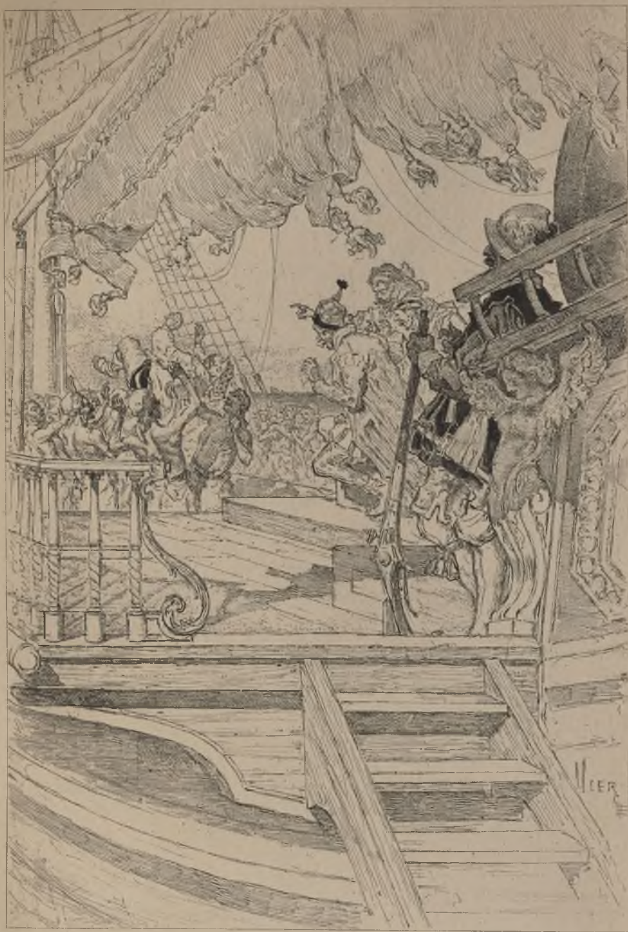
Lancho Mishandled by the Galley Slaves.