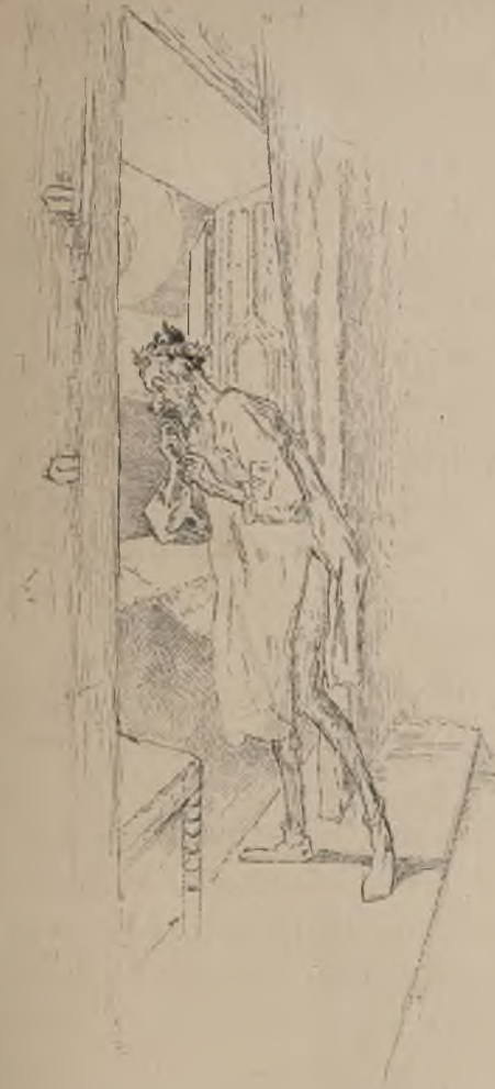
Don Quixote listens at the window

less the duchess and everybody else in the house is asleep, except the master of thy heart and thy soul's alarm; for now I