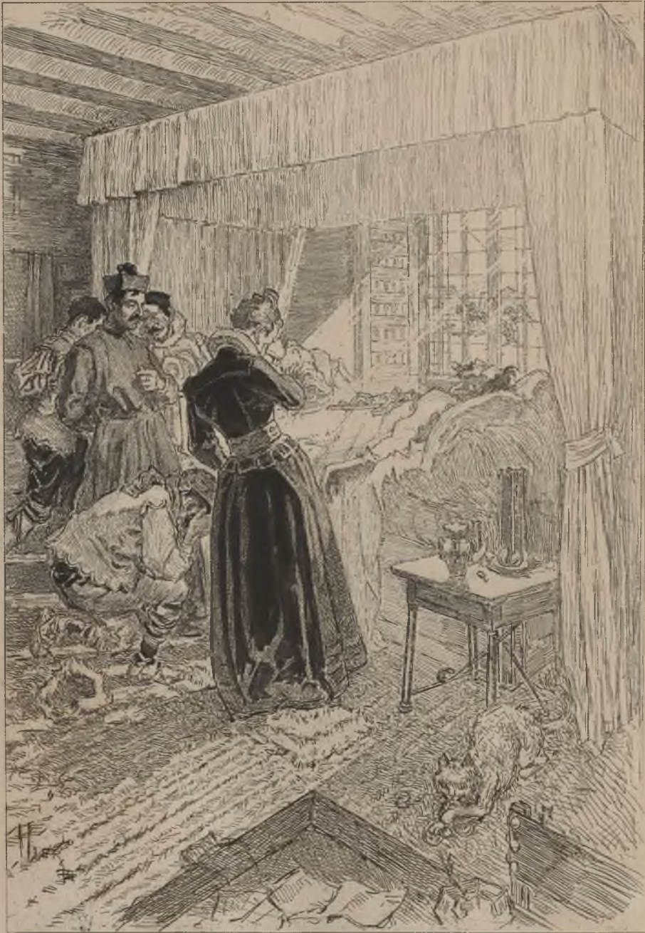
The Death of Don Quixote.