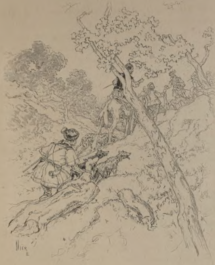
Sancho captures the hare

as plodded and amused themselves upon auguries or divinations were very fools. And therefore let us no longer trouble ourselves with them, but let us go on, and enter into our village.'