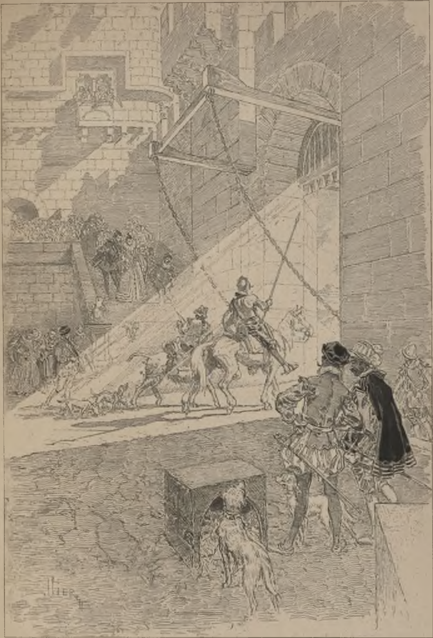
Don Quixote and Sancho Leave the Castle.