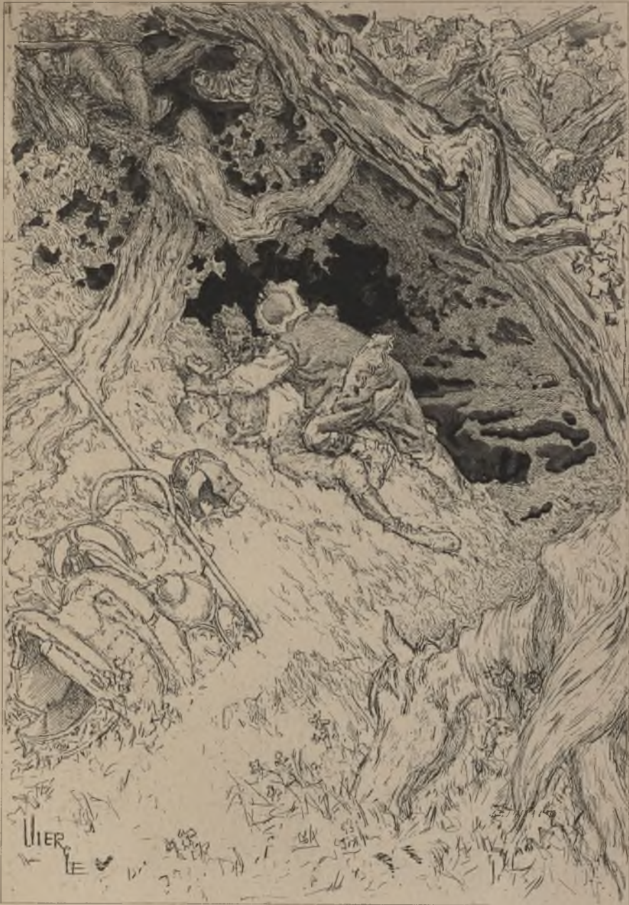
Sancho Rebels Against His Master.