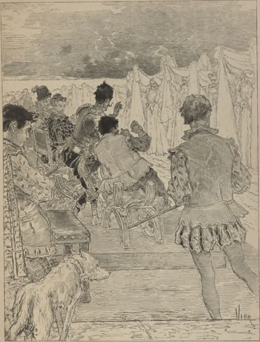
The Bearded Waiting-Women.