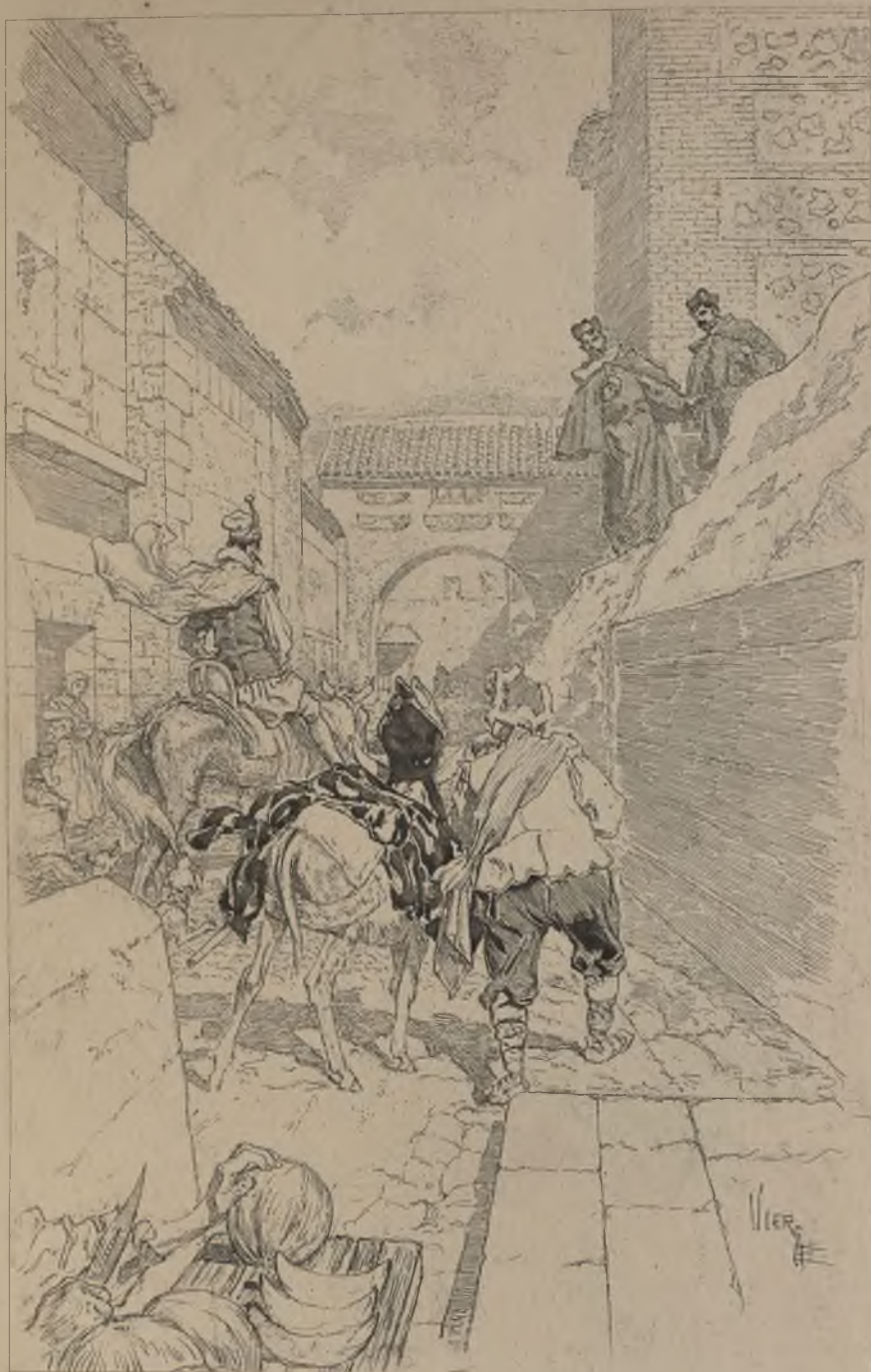
The Last Return of the Travellers