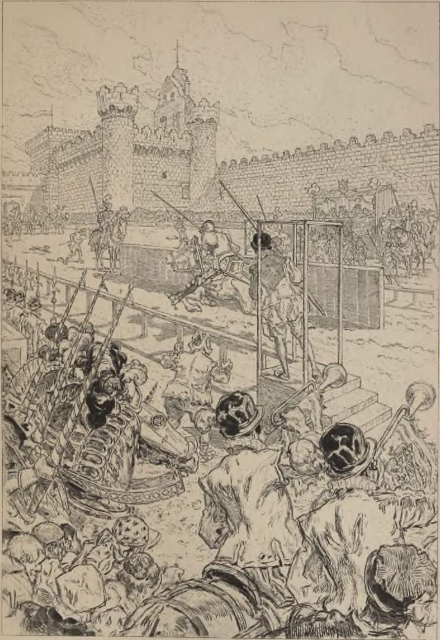
Don Quixote in the Lists with Tosilos.