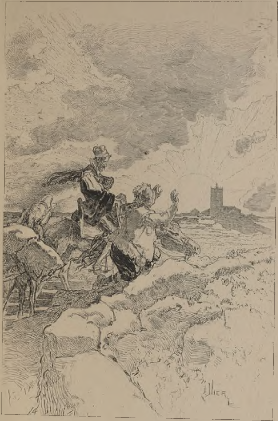
Don Quixote and Sancho in Sight of Home.