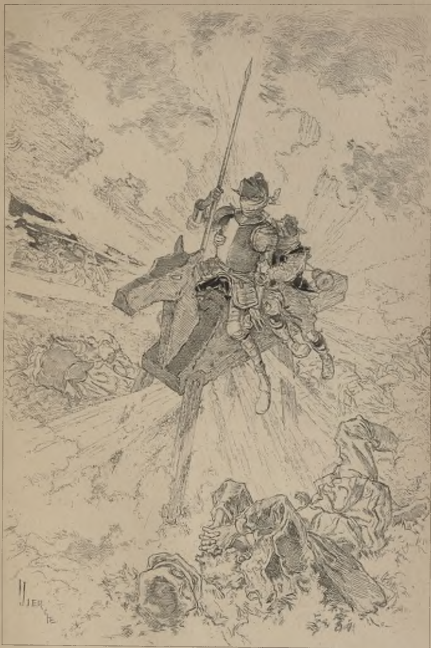
Don Quixote and Sancho on Clavileno.