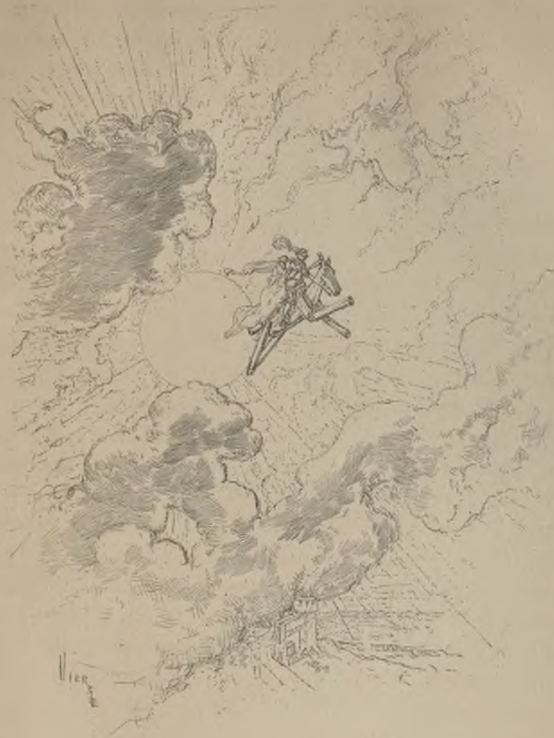
The magic horse, Clavileno

forehead, that serves for a bridle; and flies in the air so swiftly as if the devils themselves carried him. This horse, according to tradition, was made by the sage Merlin, and he lent him to his friend Pierres, who made long voyages upon him,