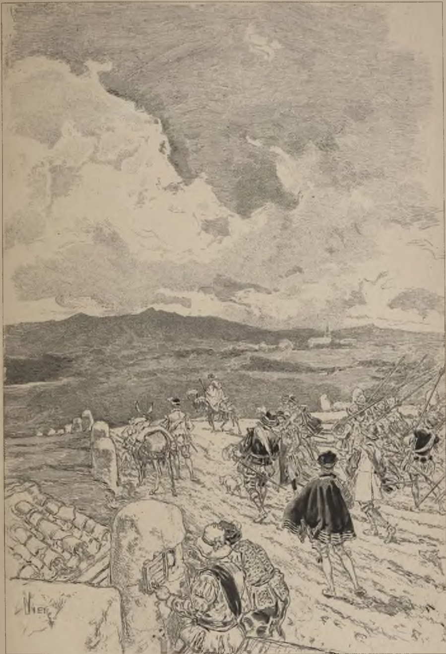
Sancho Departs for His Island.