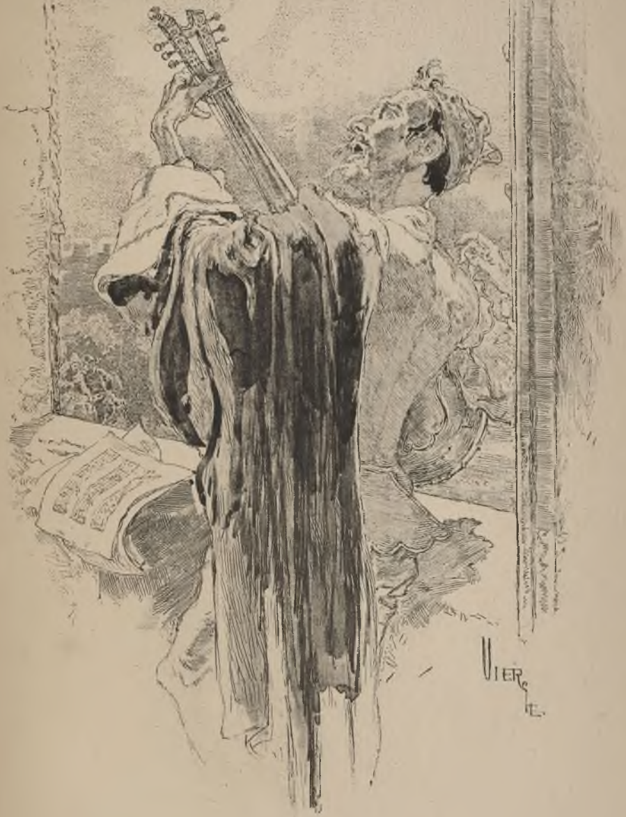
Don Quixote Bursts into Song