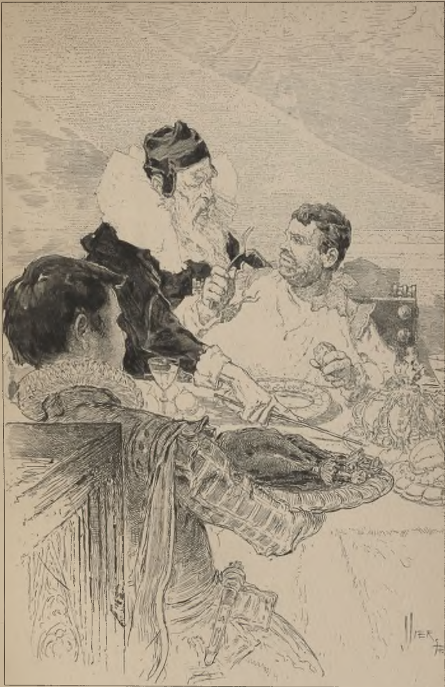
Sancho Deprived of His Food.