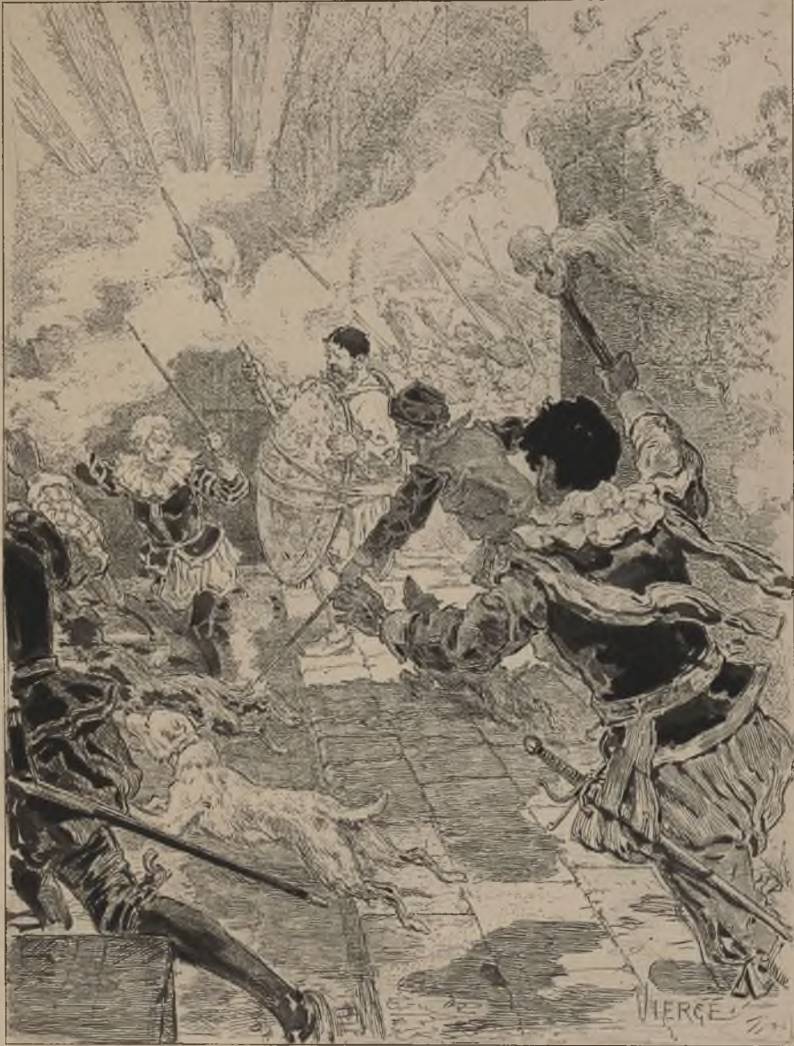
Sancho Defends His Government.