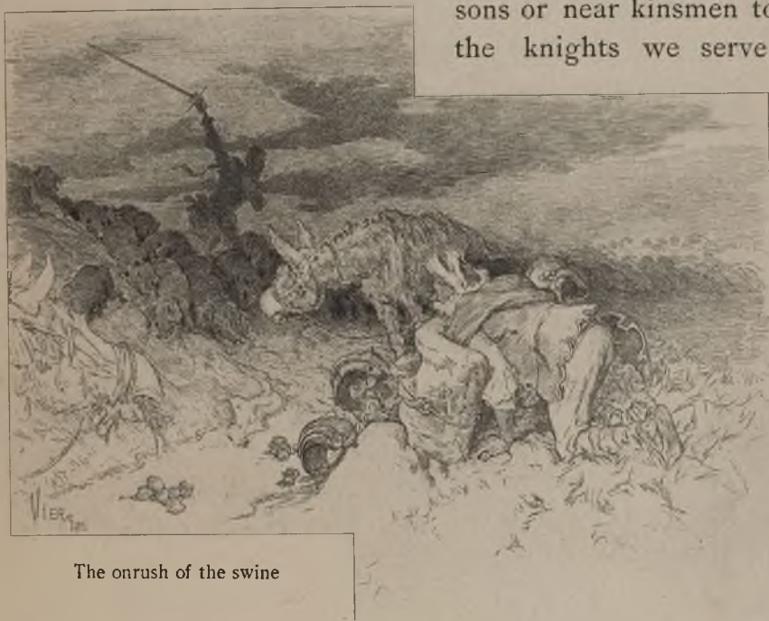
The onrush of the swine

sons or near kinsmen to the knights we serve,