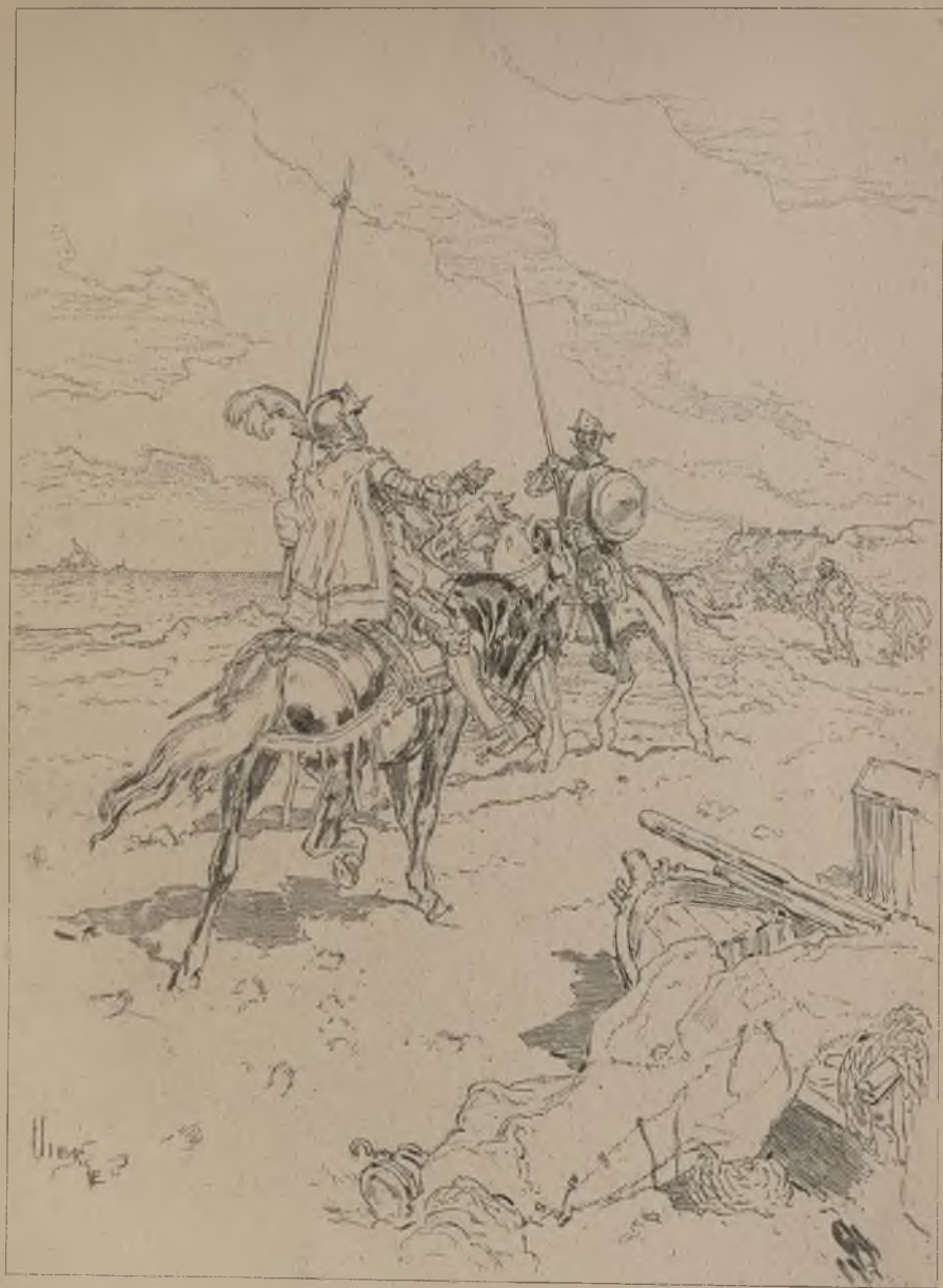
Don Quixote and the Knight of the White Moon.