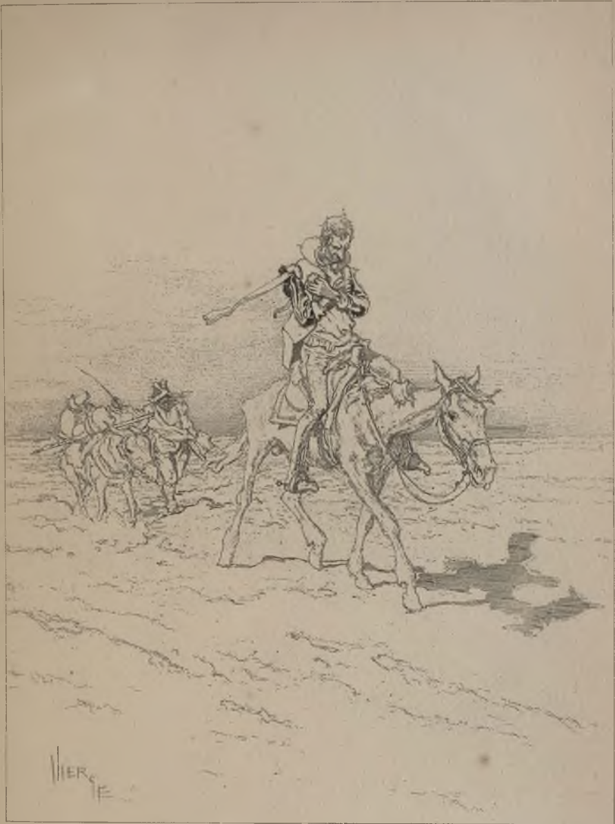
Don Quixote Leaves Barcelona.